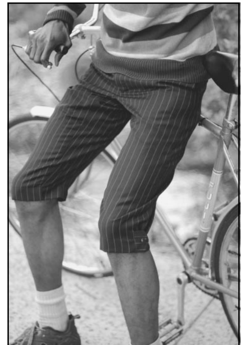
"Knickers" by Joy Riders. Available at the Temescal Farmer's Market

Beloved by generations in the SF Bay Area, since 1948, Studio One Art Center plans to reopen its 365 45th Street north Oakland doors, in January 2008, offering a Free Public Re-Opening Cel-