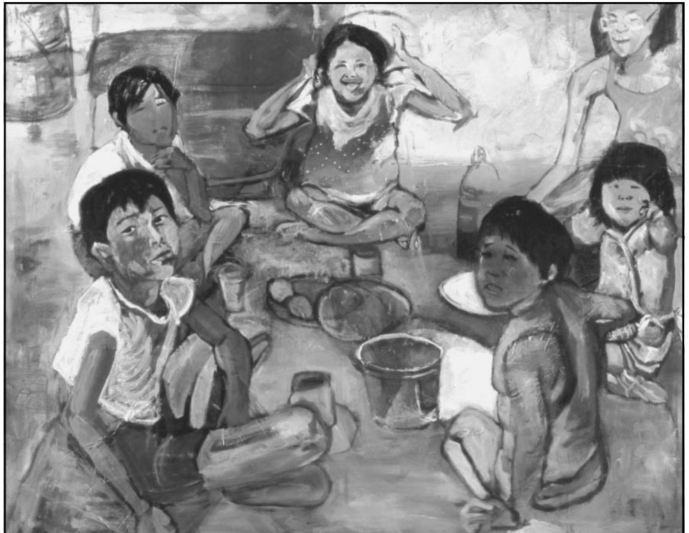
"Cousins Picnic" by Sylvia La. On Display at Desa Arts.

with a gift certificate in whatever amount you'd like. It is a gift that keeps giving. To ensure you're giving enough, check on-line for pricing of current classes www.oaklandnet.com/parks/registration/default.asp . Winter session pricing and schedules available.